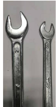
8mm & 14mm wrench