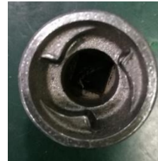
Spiral Socket tool