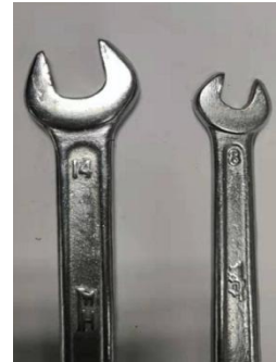
8mm & 14mm wrench