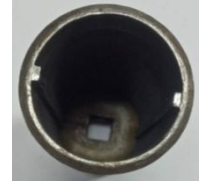
V3 castle nut tool